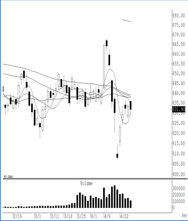
S50M24 (Close 831.90 Chg -1.60)